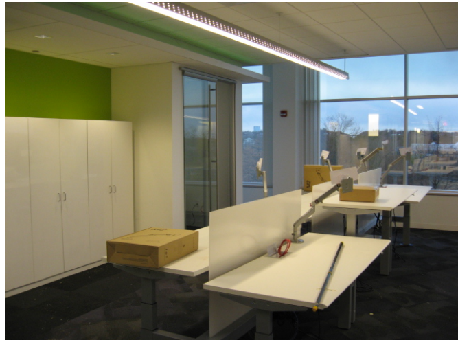
Philips Healthcare space at 200 Minuteman Rd., Andover MA